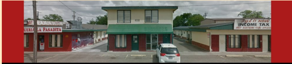
4730 Ayers Street