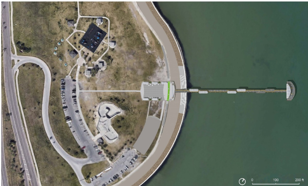
Top View of Pier Structure