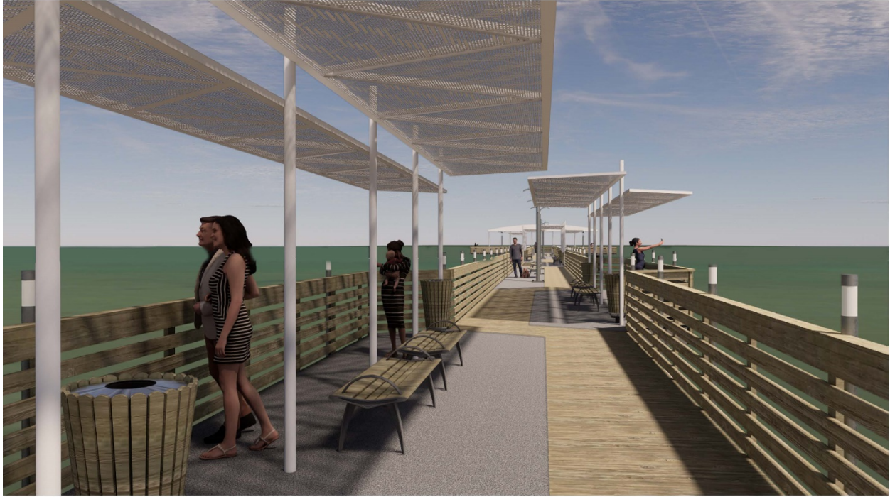
Rendering of Walkway