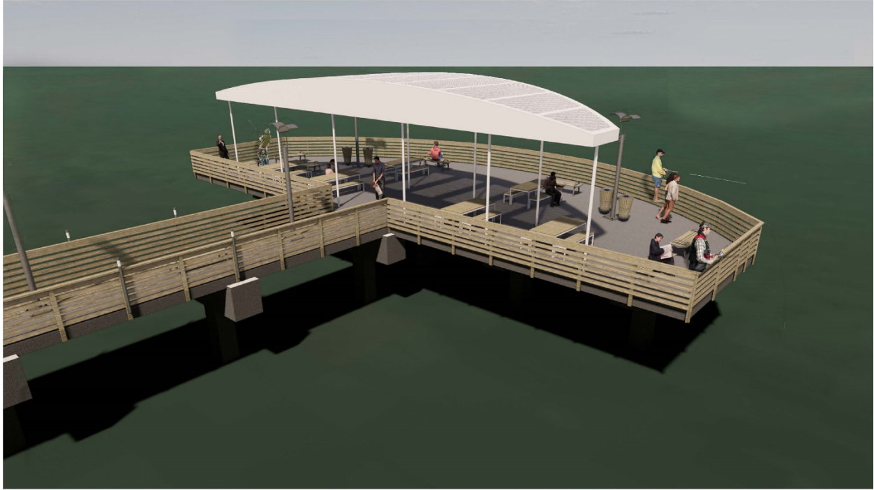
Pier Birds Eye View 2