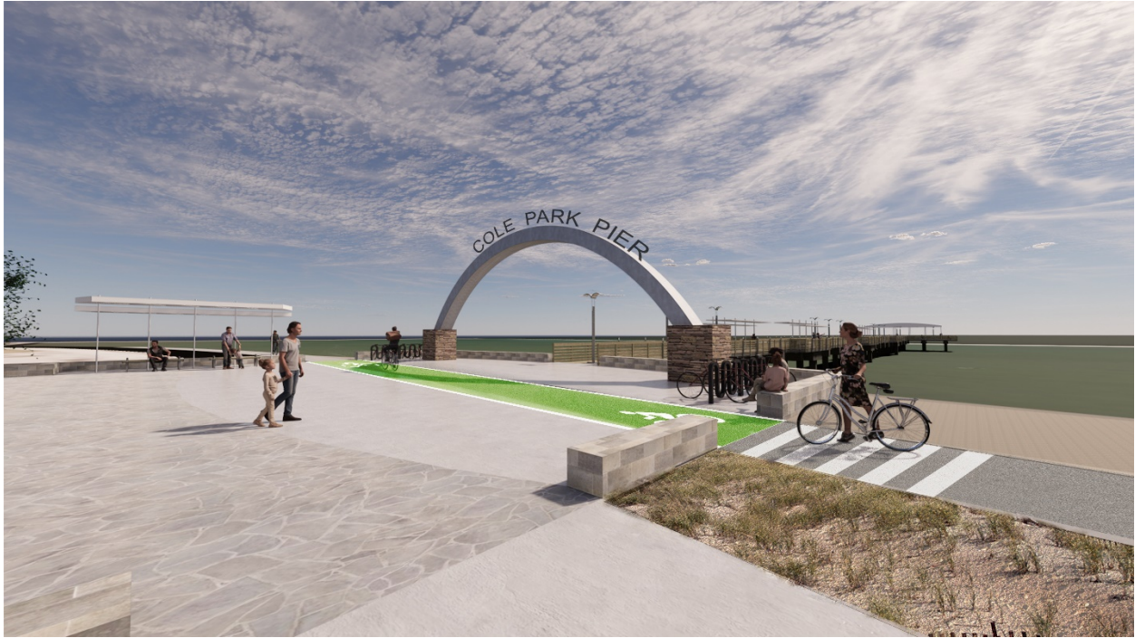
Front View of Pier Entrance

Completed by Jacobs Engineering on behalf of the City of Corpus Christi