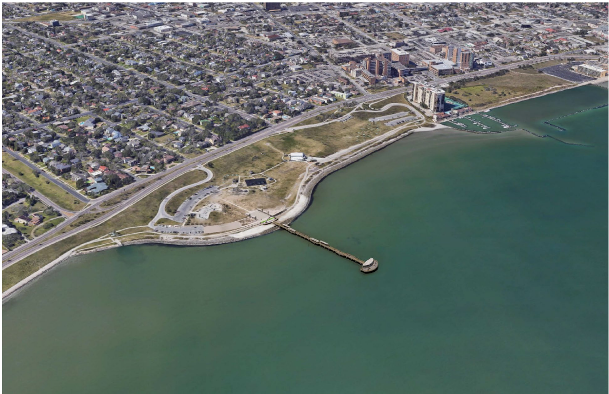
Angled Top View of Pier