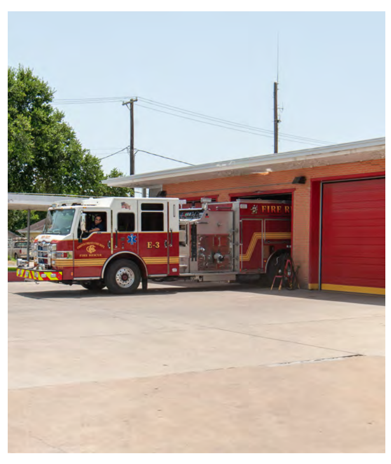
FIRE STATION #3 - MORGAN ST. (LAND ACQUISITION & DESIGN ONLY) - $750K

Replace antiquated fire station to meet current firefighting operations and standards that will allow for faster turnout times and cleaner work environments for the safety of firefighters and the public they serve.