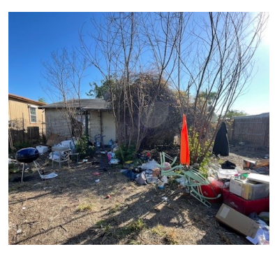
633 Belma St