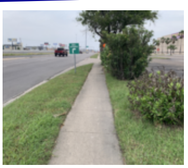
Sunrise Mall remains compliant.