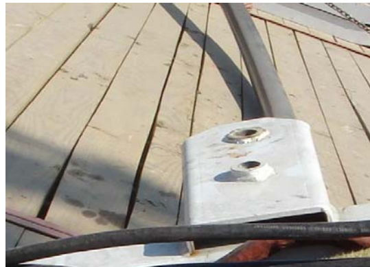
Photo 5 - The receiver assembly where the pin is inserted

The NIOSH Fire Fighter Fatality Investigation and Prevention Program is conducted by the National Institute for Occupational Safety and Health (NIOSH). The purpose of the program is to investigate fire fighter line-of-duty-deaths and formulate recommendations for preventing future deaths and injuries. The program does not seek to determine fault or place blame on fire departments or individual fire fighters but to learn from these tragic events and prevent future similar events. For more information, visit the program website at www.cdc.gov/niosh/fire or call 1-800-CDC-INFO .